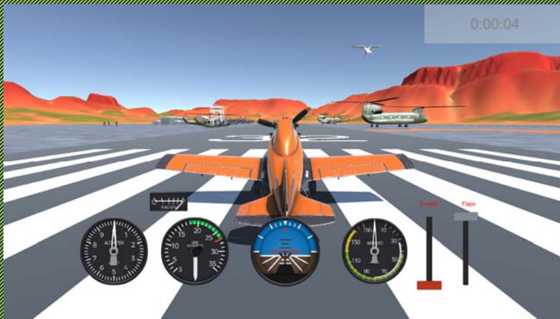
Day time Simulation